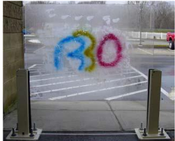
Step 2) Five minutes after remover is applied

These pictures show ACRYLITE® Soundstop noise barrier panels that were defaced or “tagged” with a solvent-based acrylic modified resin spray paint, and then cleaned with Disappear Organic Graffiti Adhesive Remover. For this test, the remover was sprayed on the graffiti and allowed to soak for 5 minutes prior to spraying with a 2300 psi pressure wash. Maximum recommended pressure is not to exceed 3000 psi. The paint was allowed to cure 25 days prior to removal.