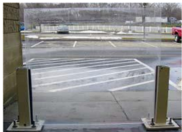
Step 4) After 2300 psi pressure washer rinse