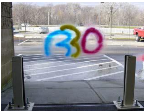
Step 1) Start of Test