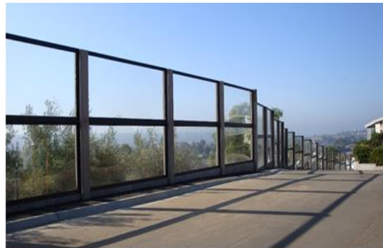
ACRYLITE® Soundstop Ready Fit System on Park Drive above the South Bay Freeway (CA-54) in Spring Valley, CA