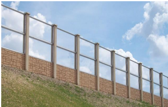
ACRYLITE® Soundstop Ready Fit System on I-75 in Dayton, OH